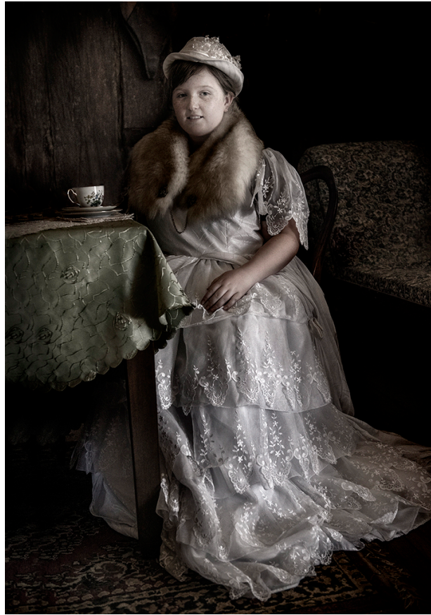
“Bygone Beauty” by Greg Fisher

I was visiting the Australian Village at Wilberforce. I walked into a hut where I saw the young lady sitting in the corner, it was very dark. I quickly changed the ISO to 2000, Aperture Priority F4 and 1/320 sec. 24 - 70 lens. I took a few shots and then outside discovered they were very underexposed. But the moment was over so no chance for a second go. Thanks to the magic of Photoshop I was able to rectify the shot and print it on Fine Art Paper.