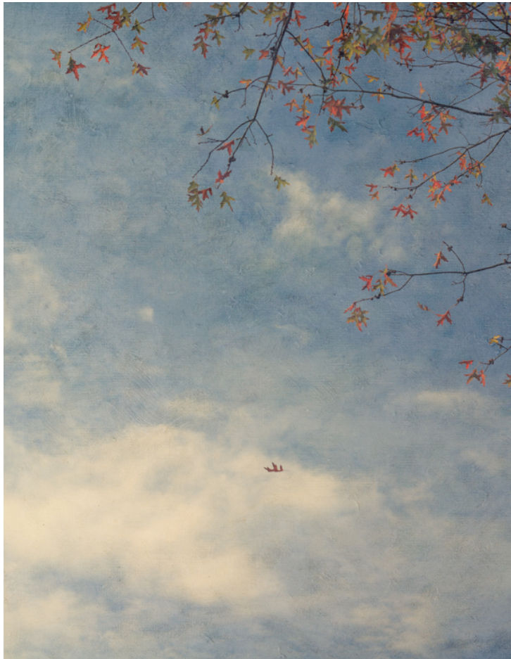
“The Fallen by Angela Mabee

“The Fallen” is an image I captured while in Bright two years ago. Mieke’s presentation last month showing her images of the Buckland Valley inspired me to revisit this set of shots. The area is well known for its colourful Autumn show, a bit like the Blue Mountains, so with my image I wanted to convey something other than just colour. I tried to capture the movement created by wind. I have a large collection of trees and leaves blowing across the frame but I liked this one because of how the leaf is silhouetted by the cloud. I have adjusted the contrast and vibrancy a little in post-processing and added some texture to the sky.