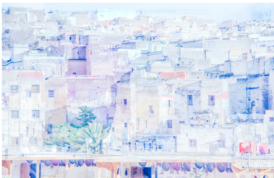
“Crowded House” by Shirley Steel