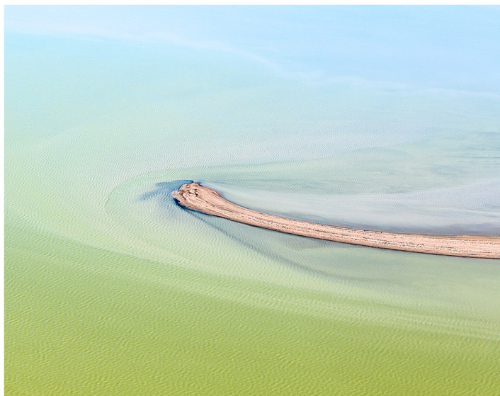
“Eric Island” by Greg Farmer

I took a tourist flight over Lake Eyre in July 2019 - at the height of the “flood”. This image is of Eric Island. I was attracted to the colour of the water and the way the island protruded into the scene. Many of the shots from the day have window reflections... This one had none thankfully.