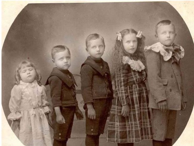
In this image, the dead girl on the left photographed with siblings.

Some of the most popular subjects of photography in the 1800s were corpses. Many famous individuals were famously photographed after their deaths, like the Clantons and McLaurys who died in the Gunfight at the O.K. Corral. But it wasn't only the famous who found themselves as posthumous models; regular people were often photographed after death also.